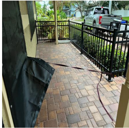
Inswing front door strapped from handle to front railing to stop water from pushed in the door.