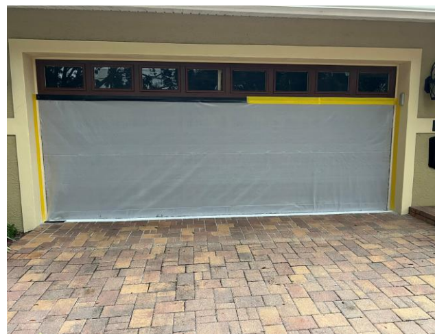
Main Garage door sealed with seal n peel, 3M spray on all edges to hold 6 mil plastic sheeting, gorilla tape all edges. Reason for different color tapes is we ran out of gorilla tape, normally would use all gorilla tape.