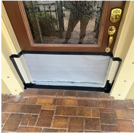
Front Door Sealed same process as garage door. But we also strapped this front door with strap see picture below to stop door from being pushed in by water.